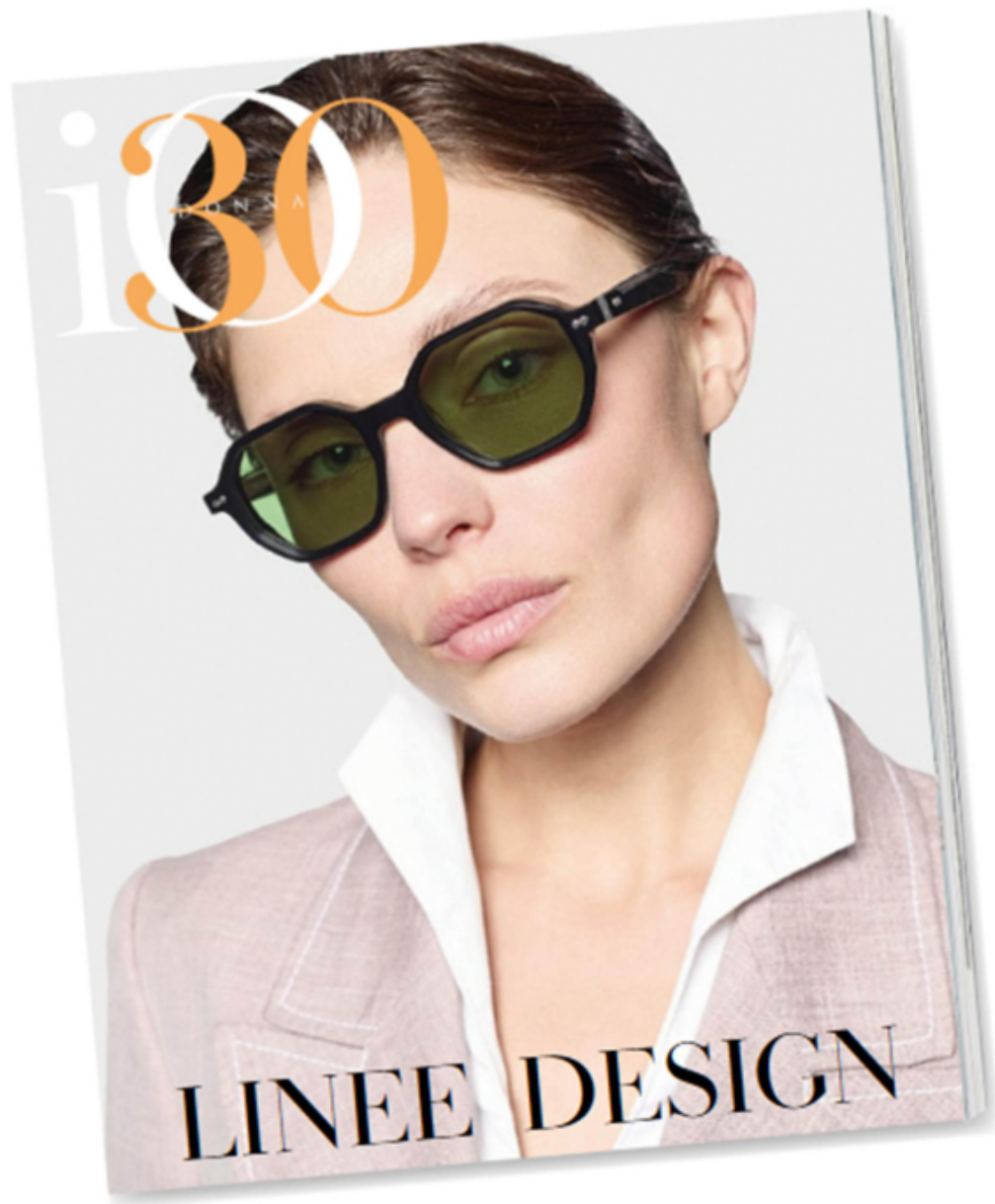
Montature scultoree e lenti in vetro firmano la nuova linea Accademia di TBD Eyewear.