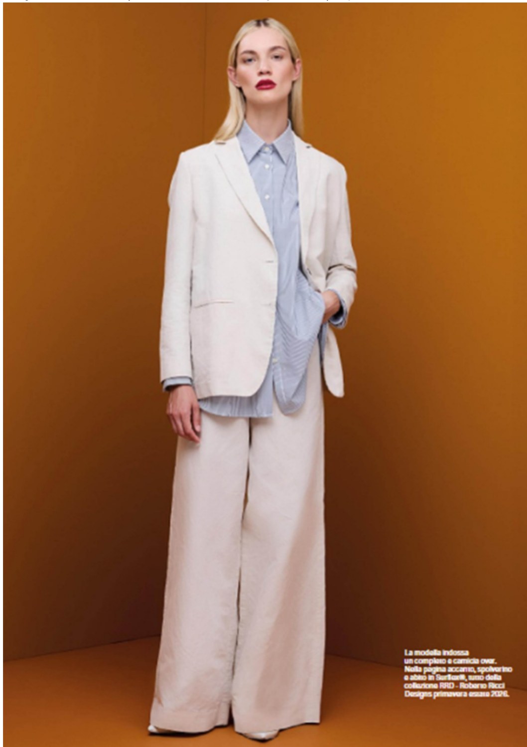
La modella indossa un completo e camicia over. Nella pagina accanto, spolverino e abito in Surliselli, tutto della collezione RRD - Roberto Ricci Designs primavera estate 2016.