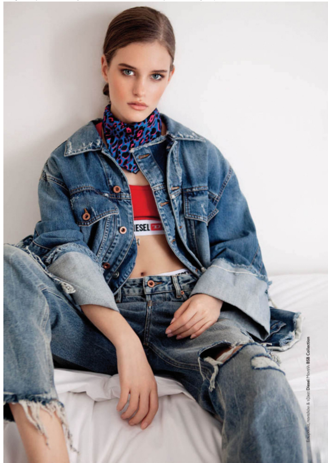
Esposizione, movimento & urban Diesel (Moyah) 858 Collection