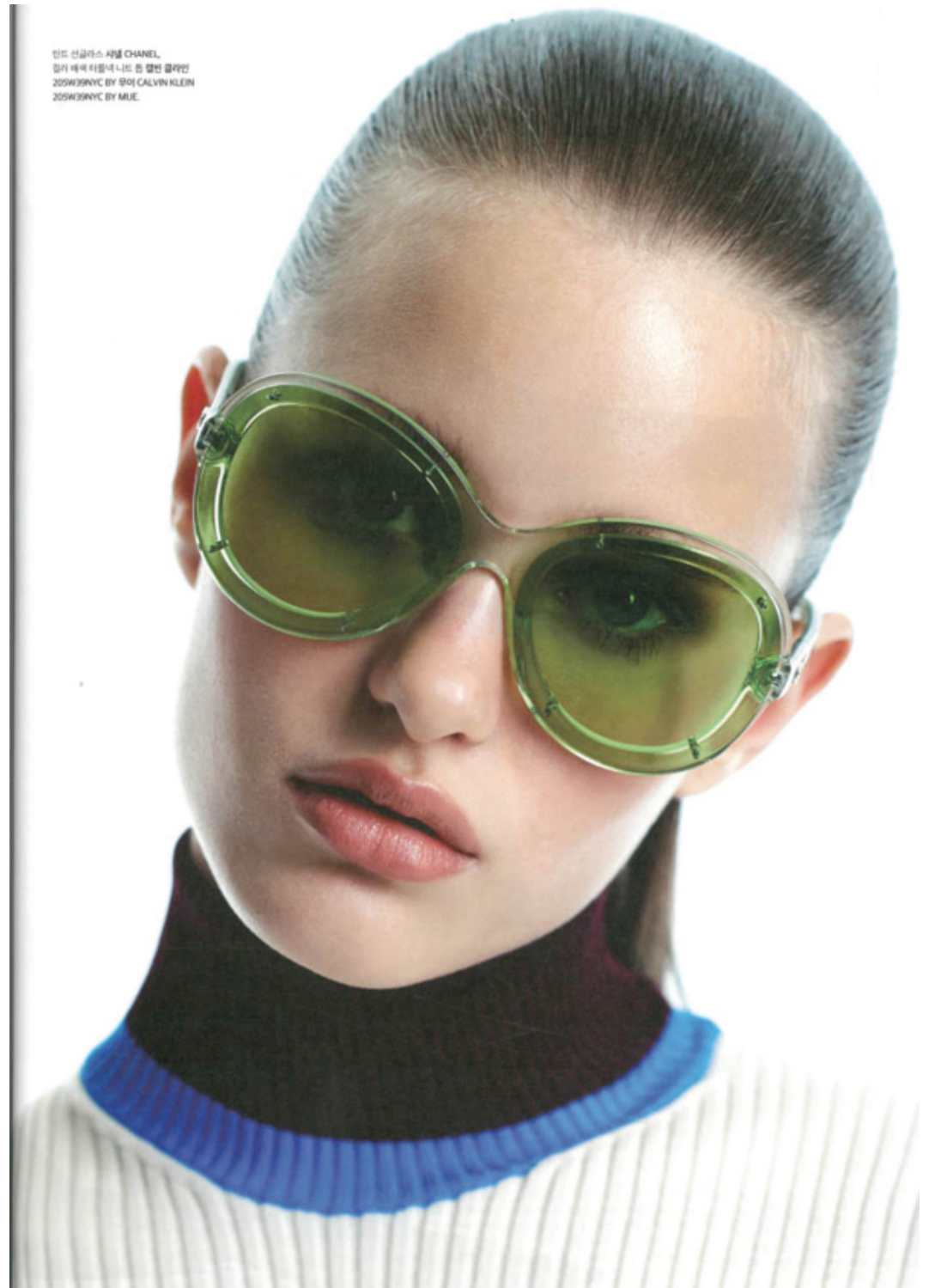
인도 선글라스 샤넬 CHANEL 입기 세에 리틀에 나트 온 뽀뽀 클리프 205W39NYC BY 무이 CALVIN KLEIN 205W39NYC BY 무이