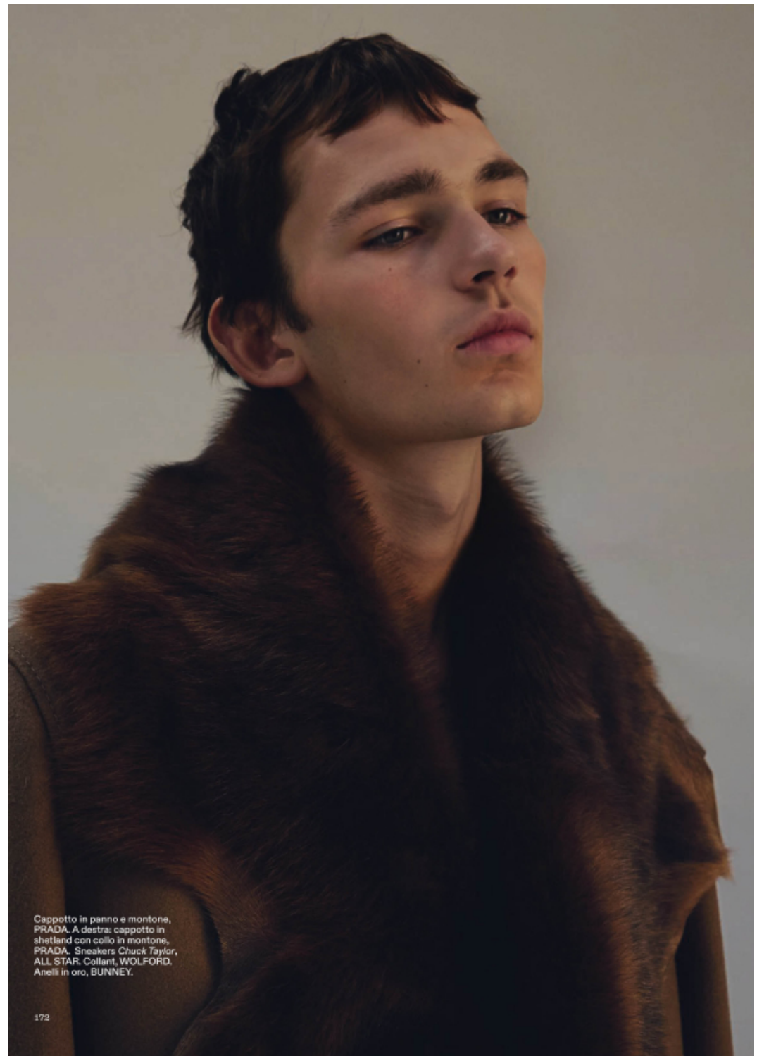
Cappotto in panno e montone, PRADA . A destra: cappotto in shattani con collo in montone, PRADA . Sneakers Chuck Taylor, ALL STAR . Collant, WOLFORD . Anelli in oro, BUNNEY .