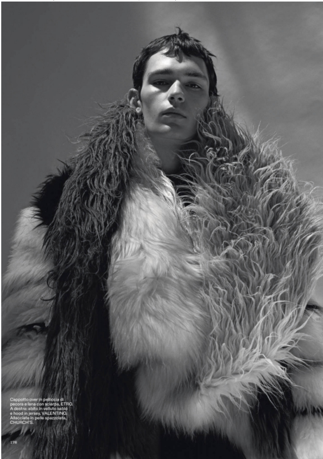
Cappotto over in pelliccia di pecora e lana con sciarpa. ETRO . A sinistra: abito in velluto sabbi e hood in jersey, VALENTINO . Allacciato in pelle spazzolata, CHURCH'S .