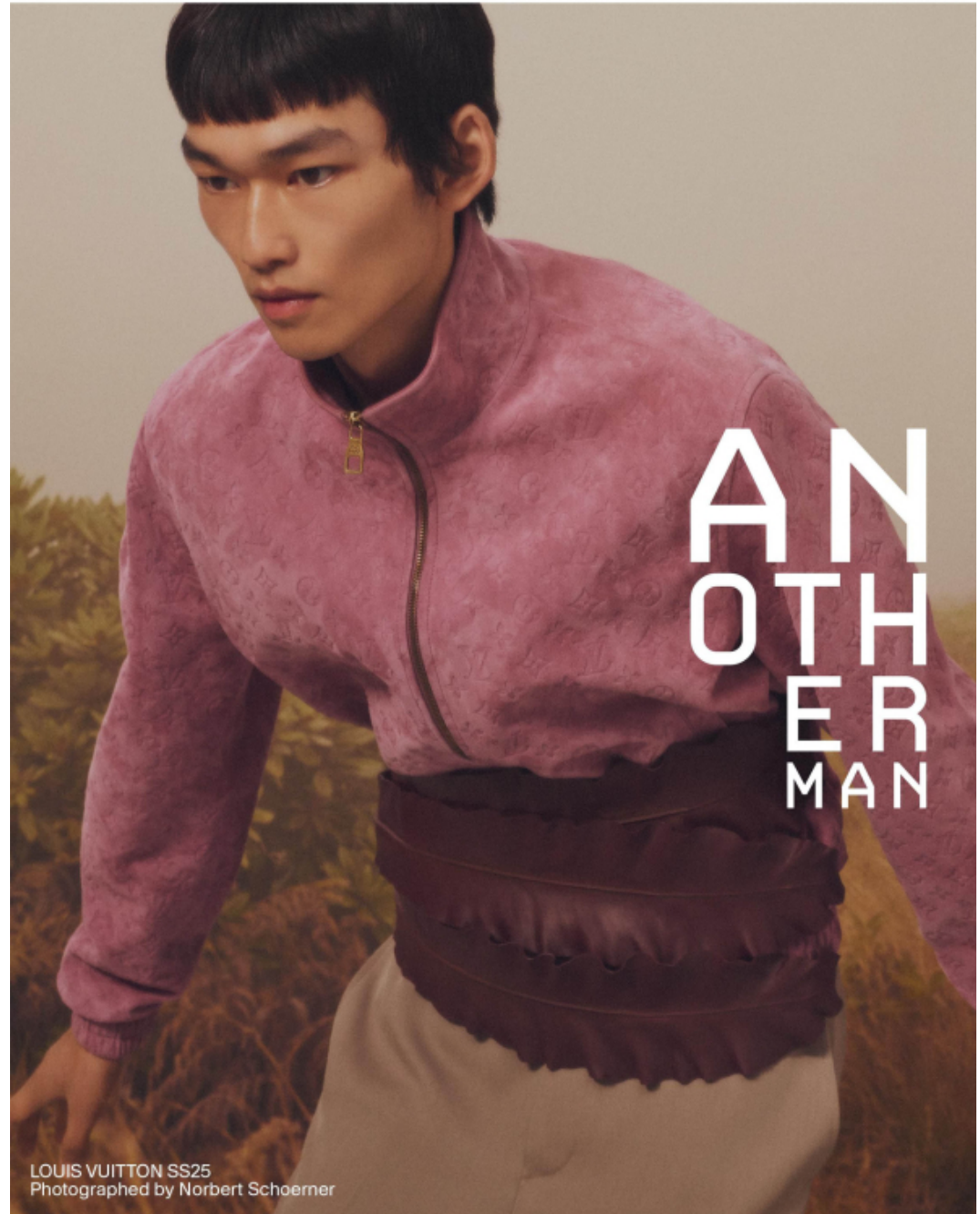
LOUIS VUITTON SS25