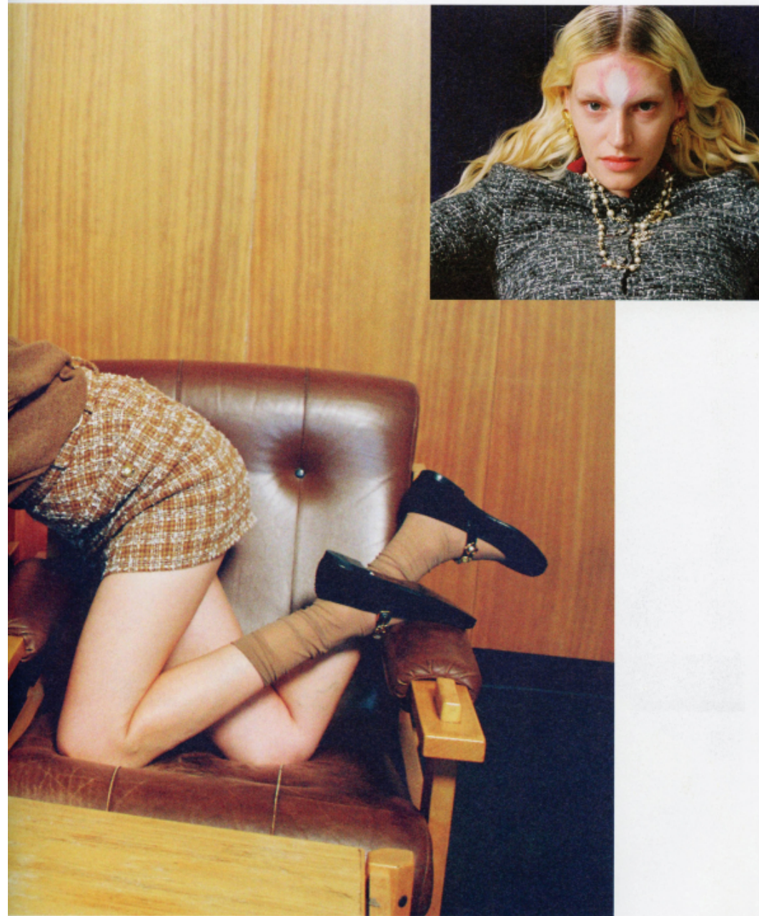
← Vesta, tvldová minisukně, boty a bižuterie, vše Chanel. Ponožky, Wolford. Hodinky Boy-Friend, náramky a prsteny Coco Crush, vše Chanel → Sako a bižuterie, obojí Chanel. Make-up: růžové pudrové oční stíny LES 4 OMBRES 88 CORAL TREASURE použité na mokro, na rtech HYDRA BEAUTY NUTRITION NOURISHING LIP CARE a rtěnka 31 Le Rouge v odstínu 1 Rouge Beige, vše Chanel