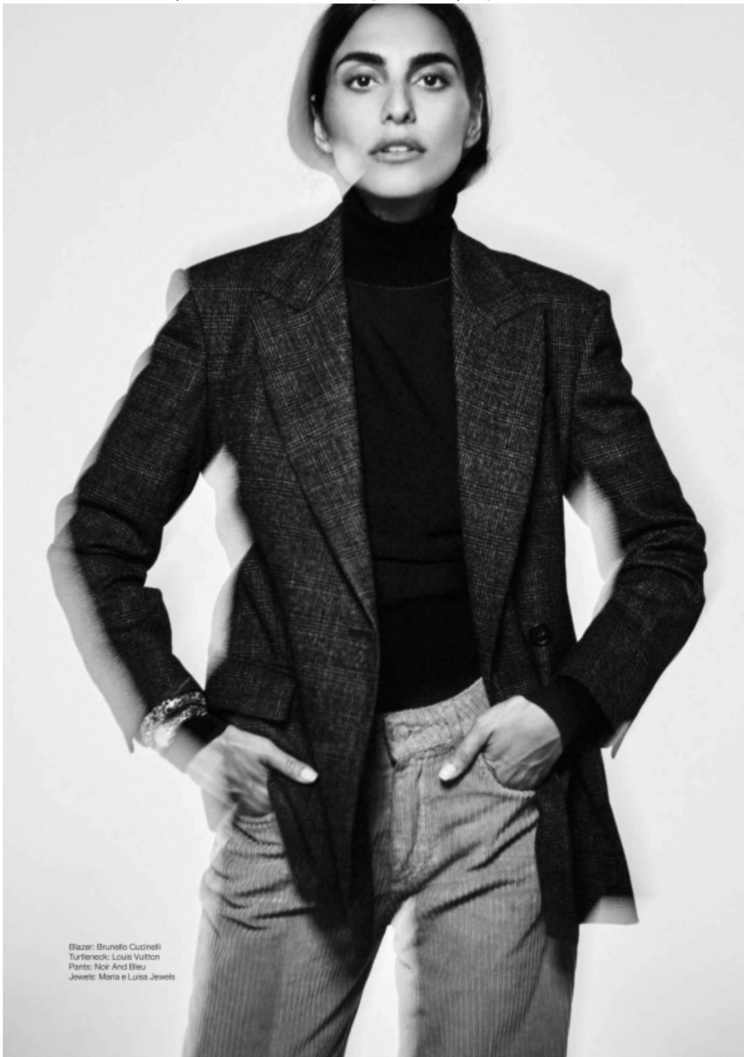
Blazer: Brunello Cucinelli Turtleneck: Louis Vuitton Pants: Noir And Bleu Jewels: Maria e Luisa Jewels