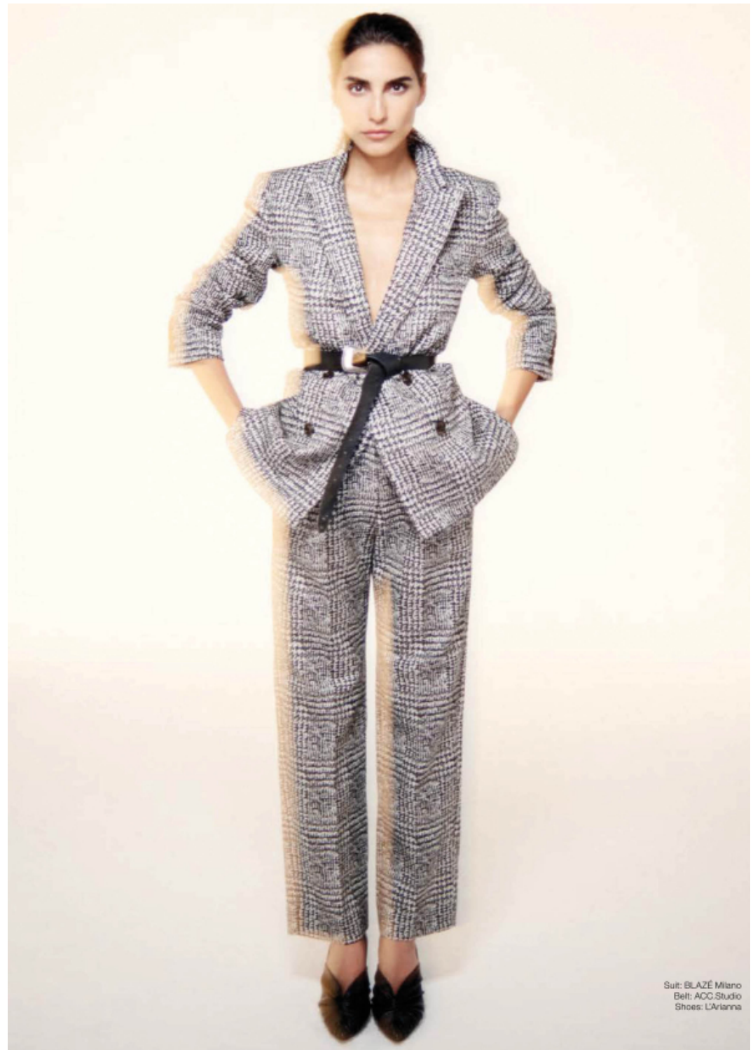
Suit: BLAZE Milano Belt: ACC Studio Shoes: L'Arianna