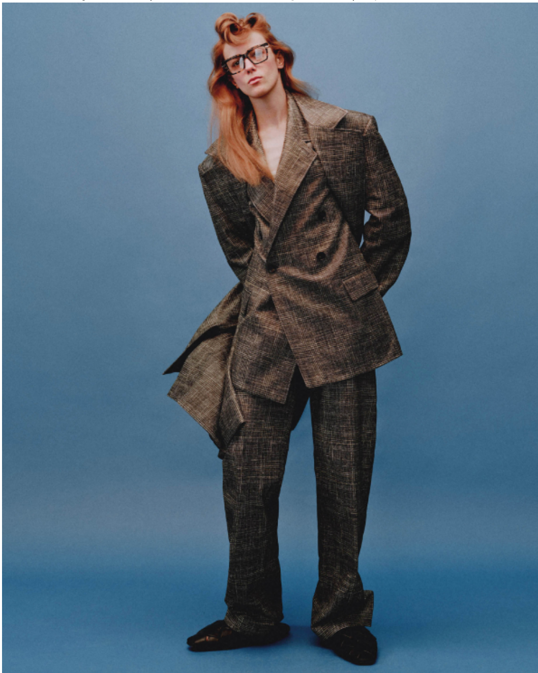
绿色皮西装, 皮大衣, 皮鞋, 格纹镂空凉鞋, 豹纹眼镜 均为Bottega Veneta