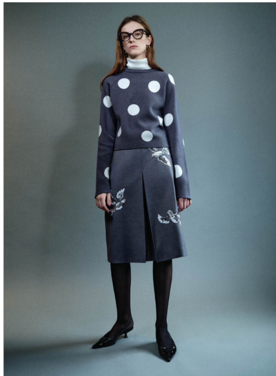
Garden of Delights Long Island 714.540.3686