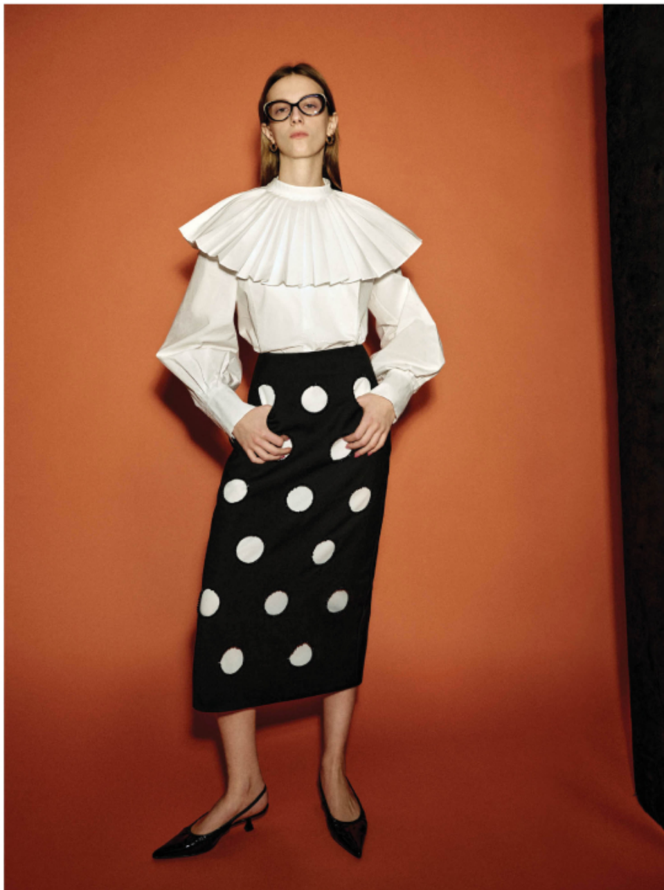
Autumn Campaign Garden of Delights, 2023

Produced by Serrer Studio. ©The Long Island Villa. All rights reserved. August 2023.