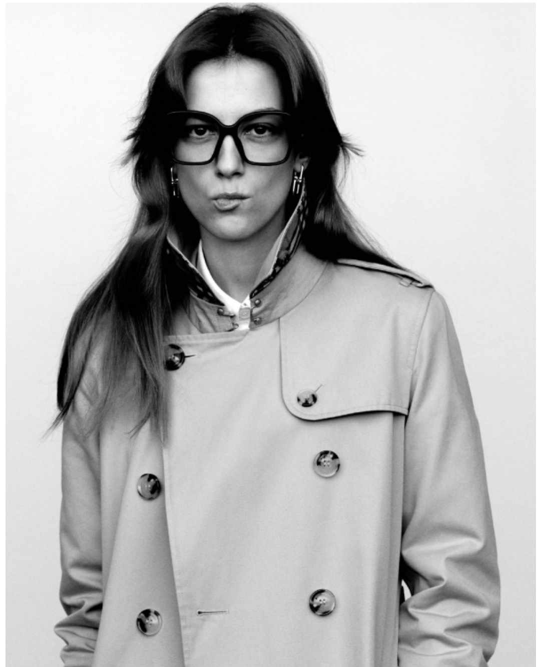
尊卓领灰型中长款Heritage Trench风衣、镂空蕾丝衣摆橡质短款衬衫 均为Burberry HardWear系列18K白金链环耳环 Tiffany & Co. 蒂芙尼