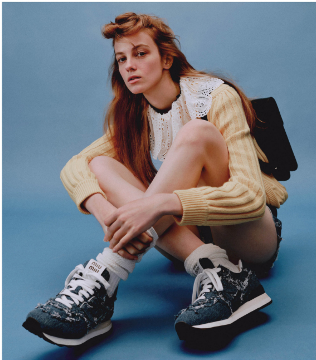
花边衬衫、黄黄色毛衣开衫 均为Claude Perlot 牛仔裙裤 Gucci 牛仔运动鞋 Miu Mu 黑色小方背包 WMWM