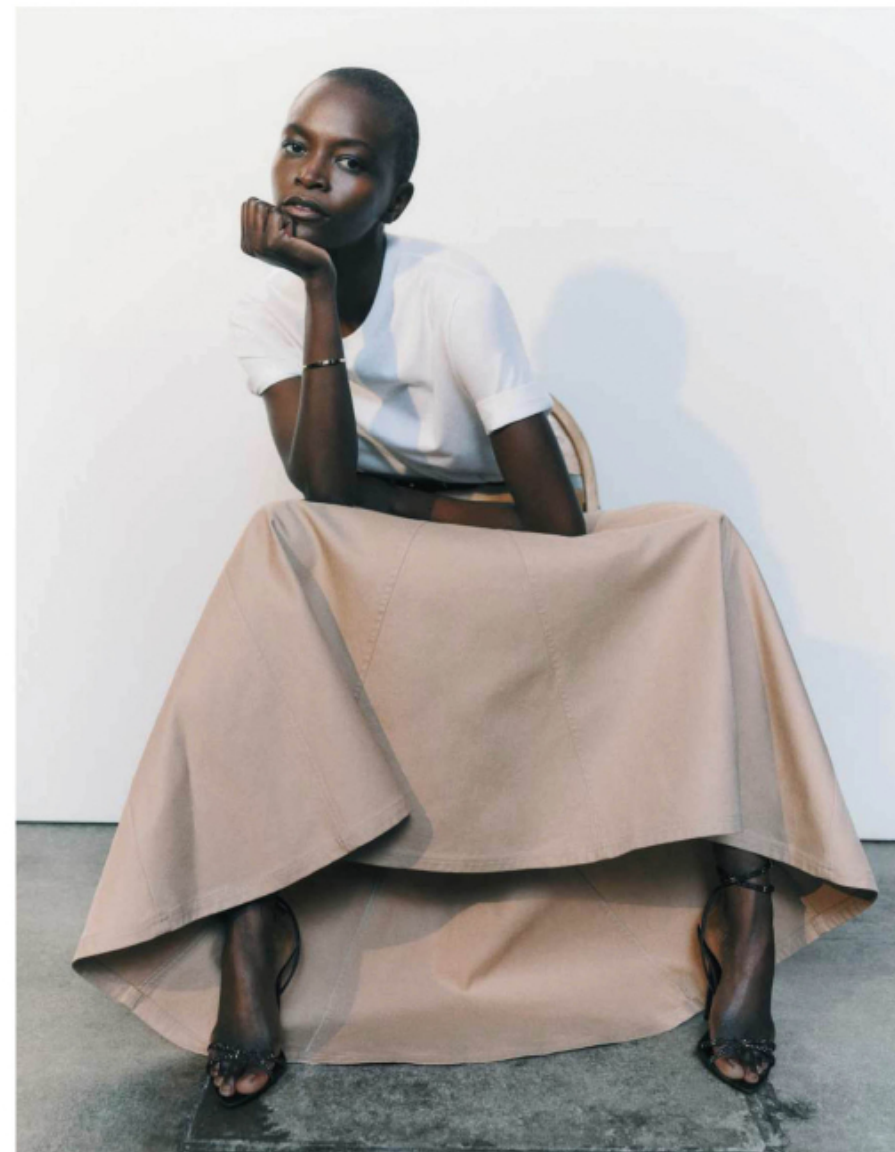
T-shirt, INTIMISSIMI . Jupe, BURBERRY . Bracelet « Serrure » en or rose et diamants, DINH VAN . Sandales, SAINT LAURENT PAR ANTHONY VACCARELLO .