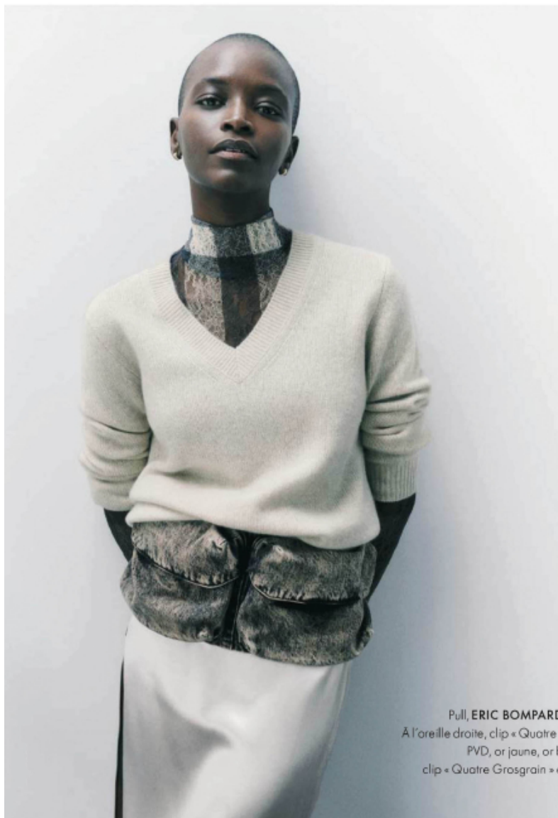
Pull, ERIC BOMPARD . Body, BURBERRY . Jupe, FENDI . À l'oreille droite, clip « Quatre Classique » en diamants, PVD, or jaune, or blanc et or rose, et, à l'oreille gauche, clip « Quatre Grosgrain » en or jaune, BOUCHERON . Sac ceinture, MIU MIU .