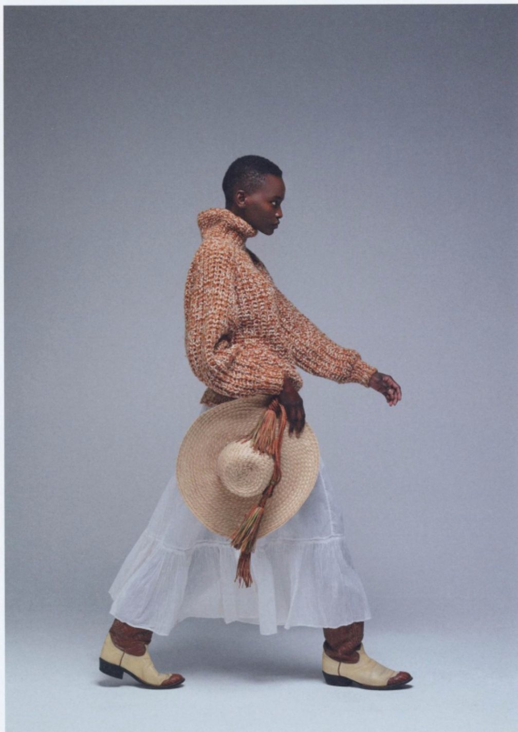
Chunky pullover RALPH LAUREN, skirt, brimmed hat, belt and boots at ANOUSHKA.