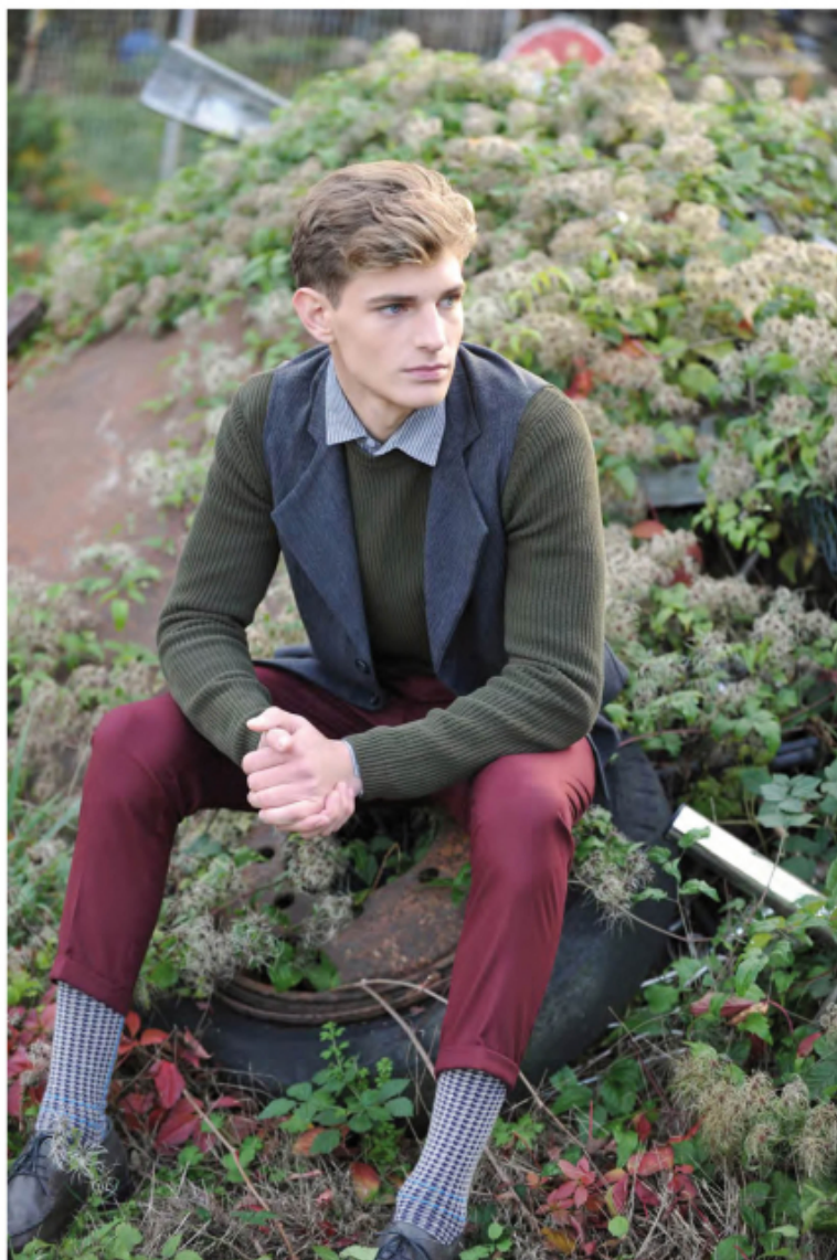
Shirt & Vest ■ FPPD Jumper & Pants ■ ZARA Belt ■ STYLIST'S OWN Socks ■ WEEKDAY Shoes ■ DEICHMANN