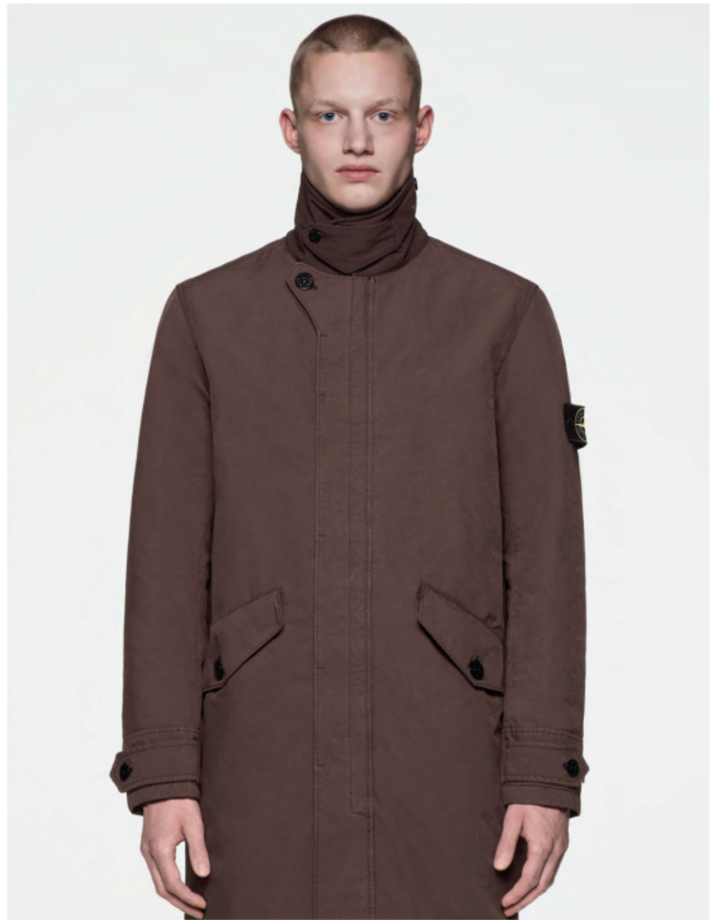
78449 DAVID-TC WITH PRIMALOFT® INSULATION TECHNOLOGY CARCOAT IN DAVID-TC WITH PRIMALOFT® INSULATION TECHNOLOGY. BEGINNING WITH A STAR-SHAPED CROSS-SECTION JAPANESE POLYESTER/POLYAMIDE SUBSTRATE, GARMENTS IN DAVID-TC ARE SEWN AND THEN SIMULTANEOUSLY GARMENT DYED AND TREATED WITH AN ANTI-DROP AGENT. DURING THE DYE PROCESS, UNDER PRESSURE AT 130°C, THE FABRIC UNDERGOES HEAT-INDUCED COMPRESSION, RADICALLY TRANSFORMING ITS HAND AND BODY. THE FINISHED GARMENT IS ENGINEERED TO BE THEN PADDED WITH AN INNER LAYER OF PRIMALOFT®, AN EXCLUSIVE BLEND OF ULTRA-SMALL DIAMETER FIBRES RESULTING IN SUPERIOR THERMAL PERFORMANCE. HIDDEN TWO-WAY ZIP FASTENING AND HIDDEN BUTTONS FASTENING.