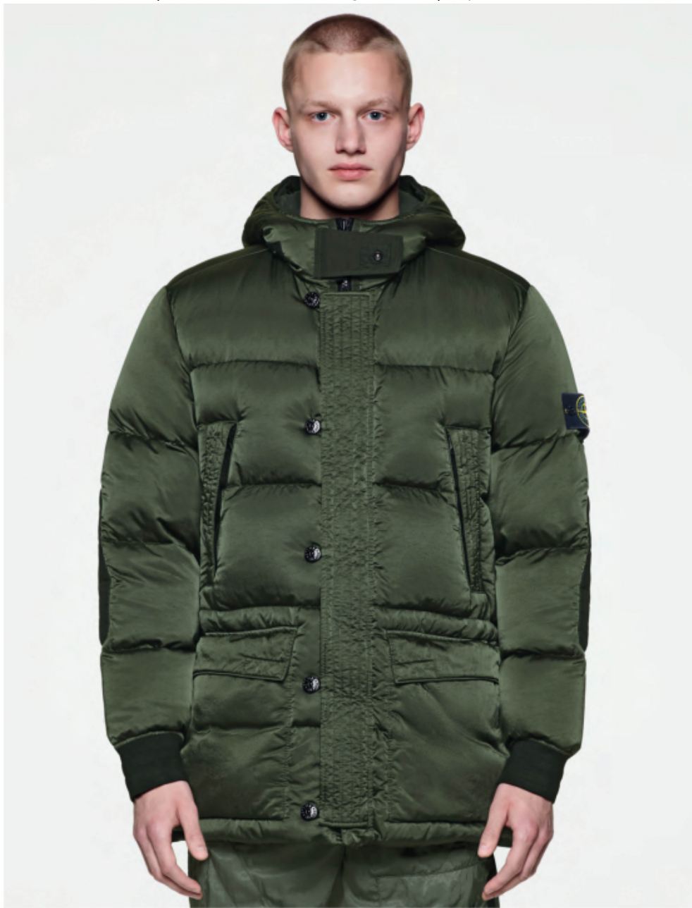
48821 NYLON RASO DOWN-TC DOWN JACKET MADE OF A SPECIAL 100% NYLON SATIN, WITH A SILKY AND TRANSLUCENT APPEARANCE. THE PIECE IS PADDED WITH THE FINEST FEATHERS, SPECIFICALLY TREATED TO WITHSTAND THE GARMENT DYEING PROCEDURE. THE ADDITION OF A SPECIAL AGENT TO THE DYE RECIPE CREATES AN ANTI-DROP EFFECT. TWO-WAY ZIP FASTENING EDGED WITH TAPES, HIDDEN BY THE OVERSTITCHED PLACKET WITH BUTTONS HELD BY ELASTICATED LOOPS.