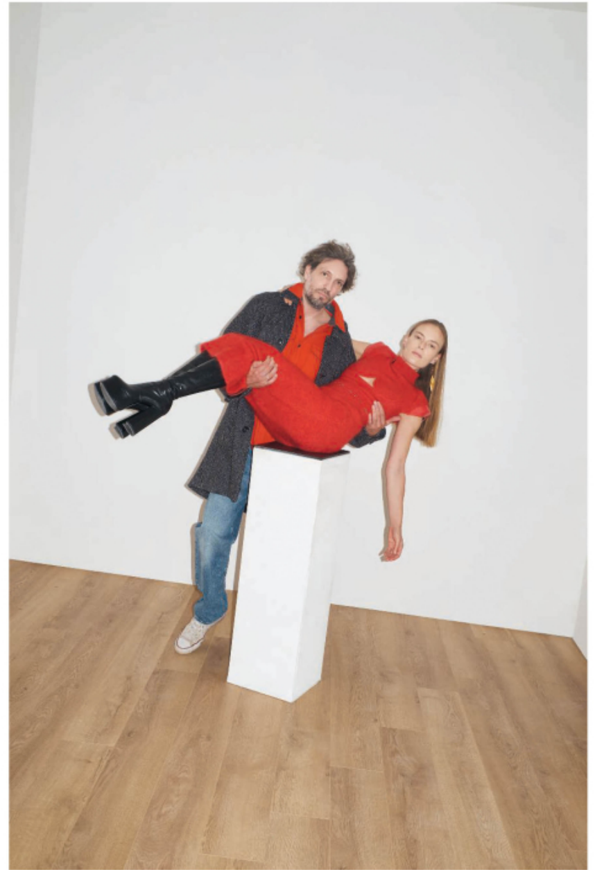
Per Ania. Abito con collo alto di mohair garzato, Sportmax; stivali Saint Laurent vintage. Per Simon. Cappotto e camicia, tutto Woolrich; jeans di denim effetto slavato, Gas; sneakers vintage.