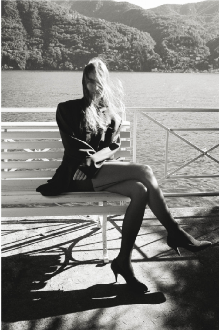
over wool blazer and jersey/tulle top HALFBOY shoes stylist's own