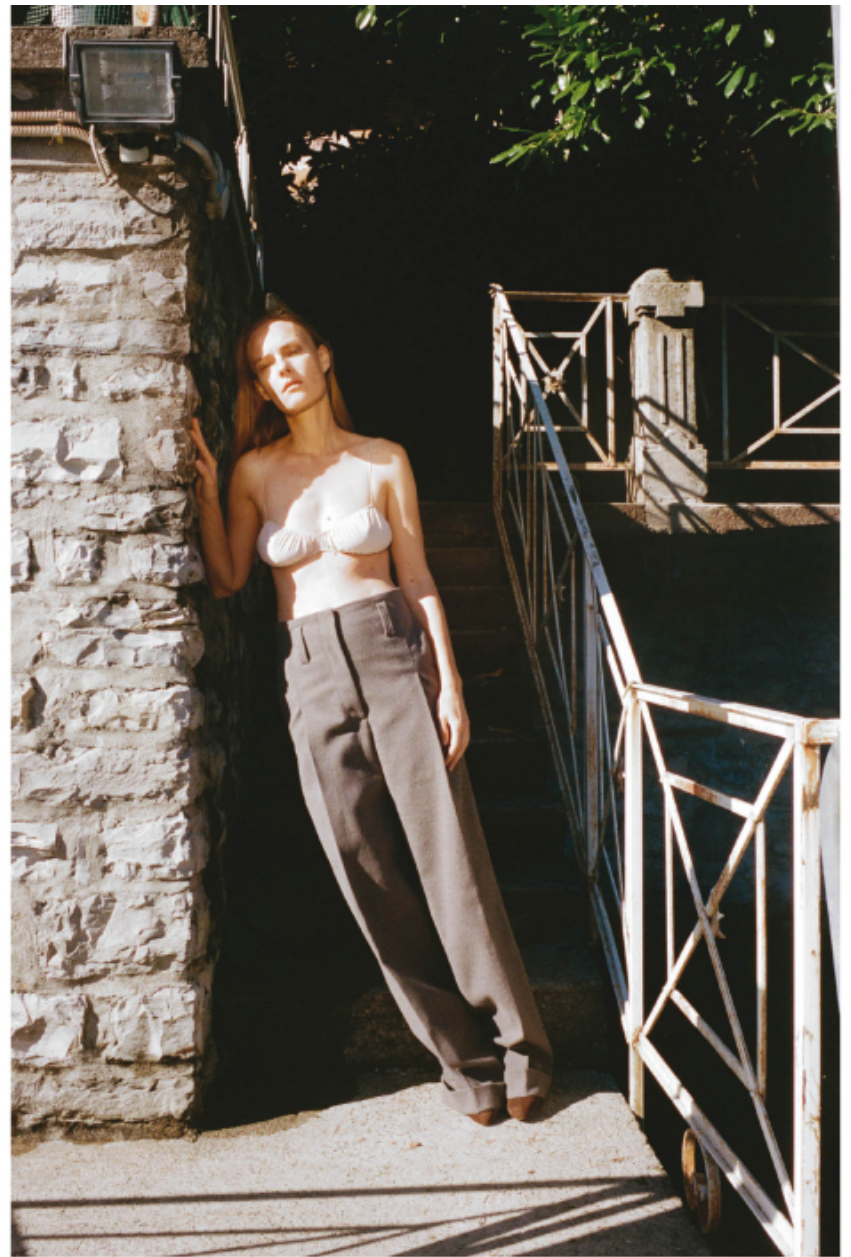
wool trousers PHILOSOPHY DI LORENZO SERAFINI bra stylist's own