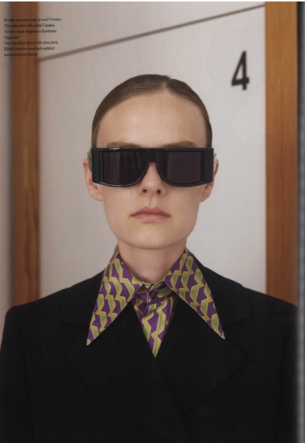
Double-breasted coat in wool Versace 70s satin shirt with collar Canaku Acetate mask sunglasses Sportmax Opposite: One-shoulder dress with velvet belt, Ribbed merino wool and cashmere turtleneck, Toy Burch