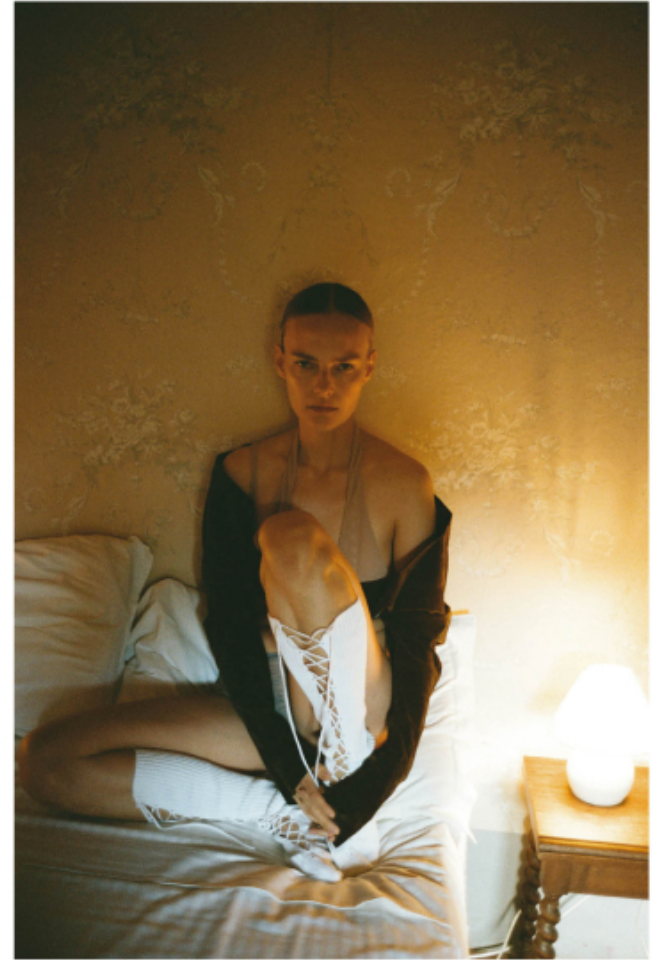
velvet crep top ALESSANDRO VIGILANTE socks PRADA