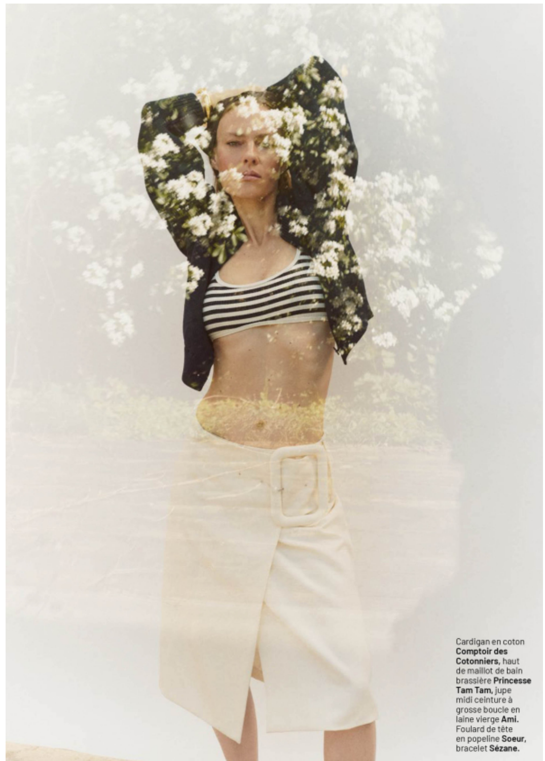
Cardigan en coton Comptoir des Cotonniers , haut de maillot de bain brassière Princesse Tam Tam , jupe midi ceinture à grosse boucle en laine vierge Ami . Foulard de tête en popeline Soeur , bracelet Sézane .