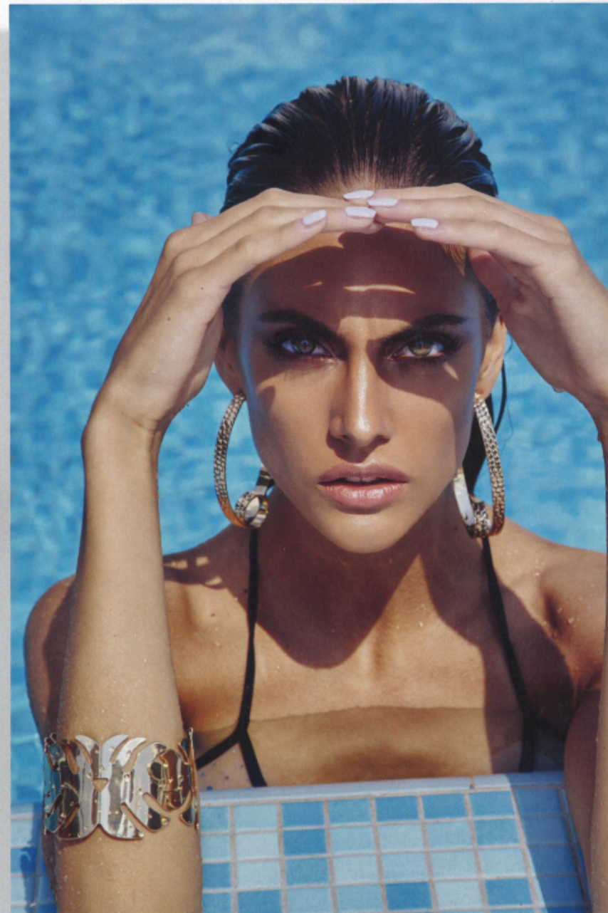
КУПАЛИ DAMSEL IN DISTRESS НАРУКВИЦА И МИНИТУЛЕ SIX