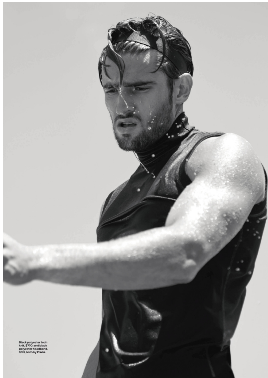
Black polyester tech knit, $70, and black polyester headband, $90, both by Prada .