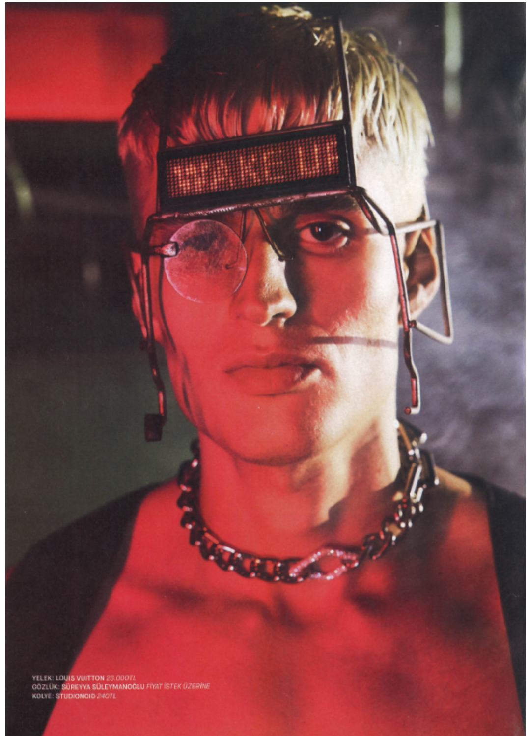
YELEK: LOUIS VUITTON 23.000TL GÖZLÜK: SÜREYYA SÜLEYMANOĞLU FİYAT İSTEK ÜZERİNE KOLYE: STUDIOCID 2407L