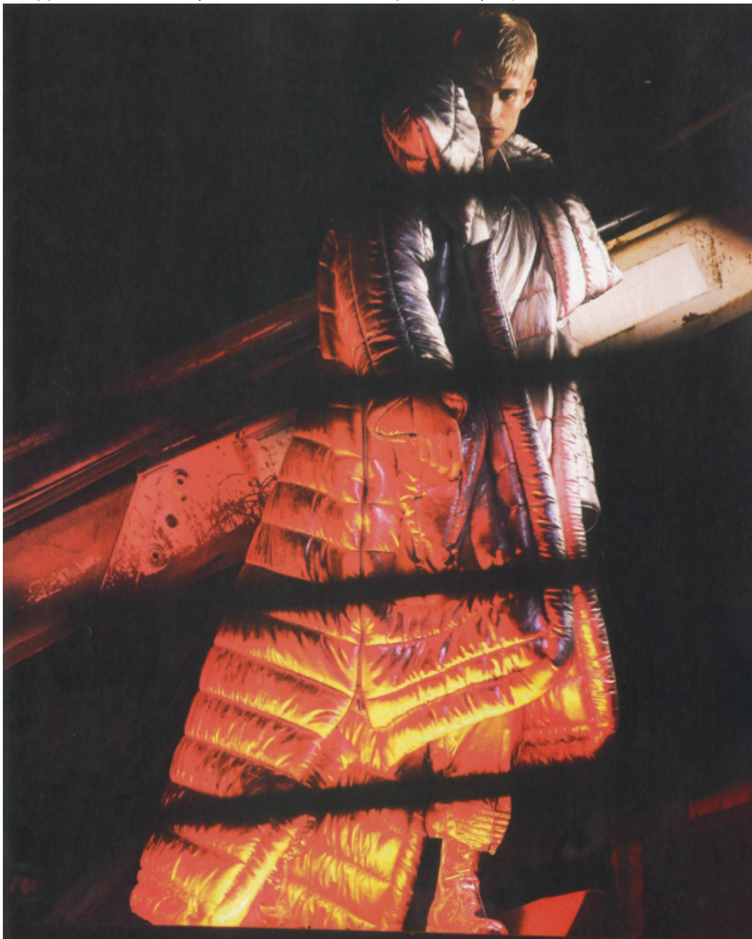
PALTO: HAKAN AKKAYA FİYAT İSTEK ÜZERİNE EŞOFMAN ÜSTÜ: ADIDAS 760 TL EŞOFMAN: ADIDAS 630 TL BOT: HAKAN AKKAYA FİYAT İSTEK ÜZERİNE