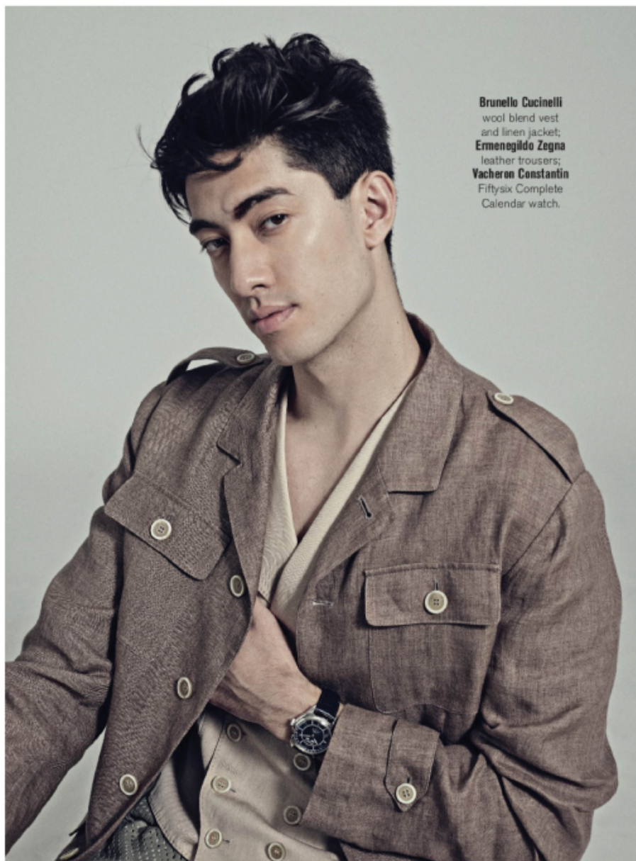
Brunello Cucinelli wool blend vest and linen jacket; Ermenegildo Zegna leather trousers; Vacheron Constantin Fiftysix Complete Calendar watch.