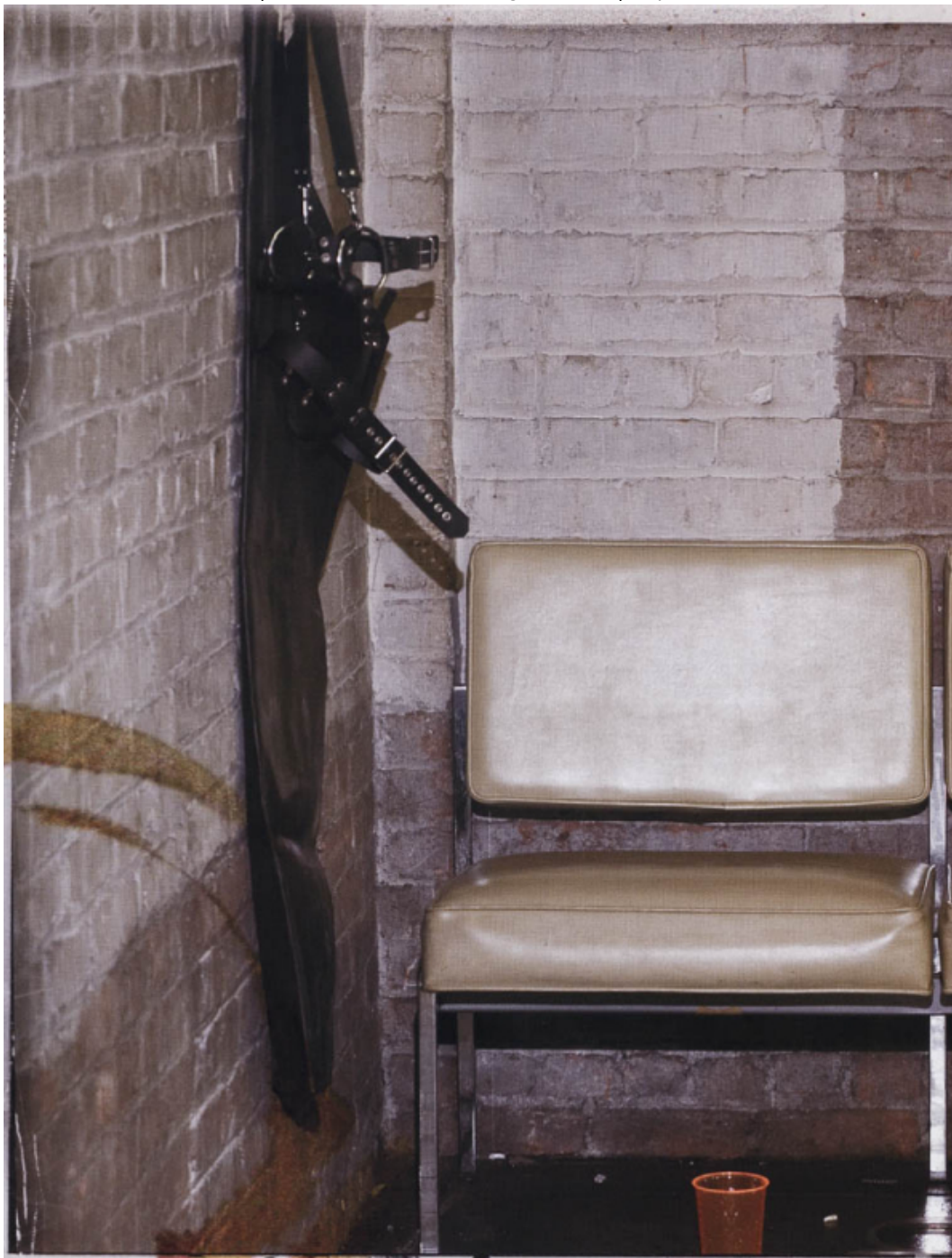
GIRLS ON FILM PHOTO