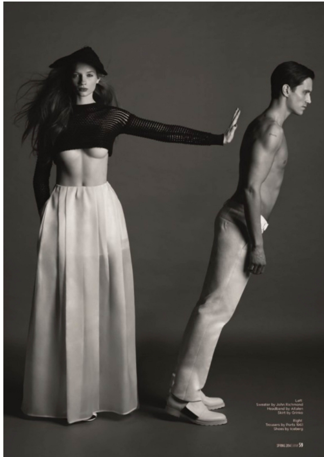
Left: Sweater by John Richmond Headband by Altalen Skirt by Grinko Right: Trousers by Ports 1961 Shoes by Acberg