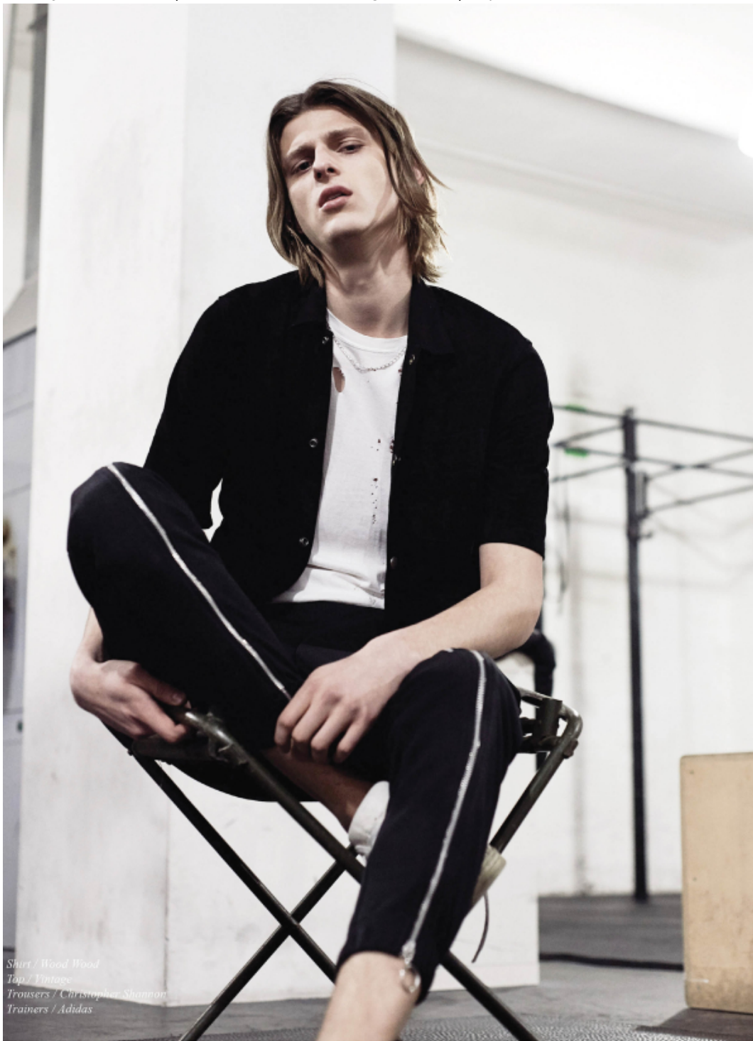
Shirt / Wood Wood Top / Vintage Trousers / Christopher Shannon Trainers / Adidas