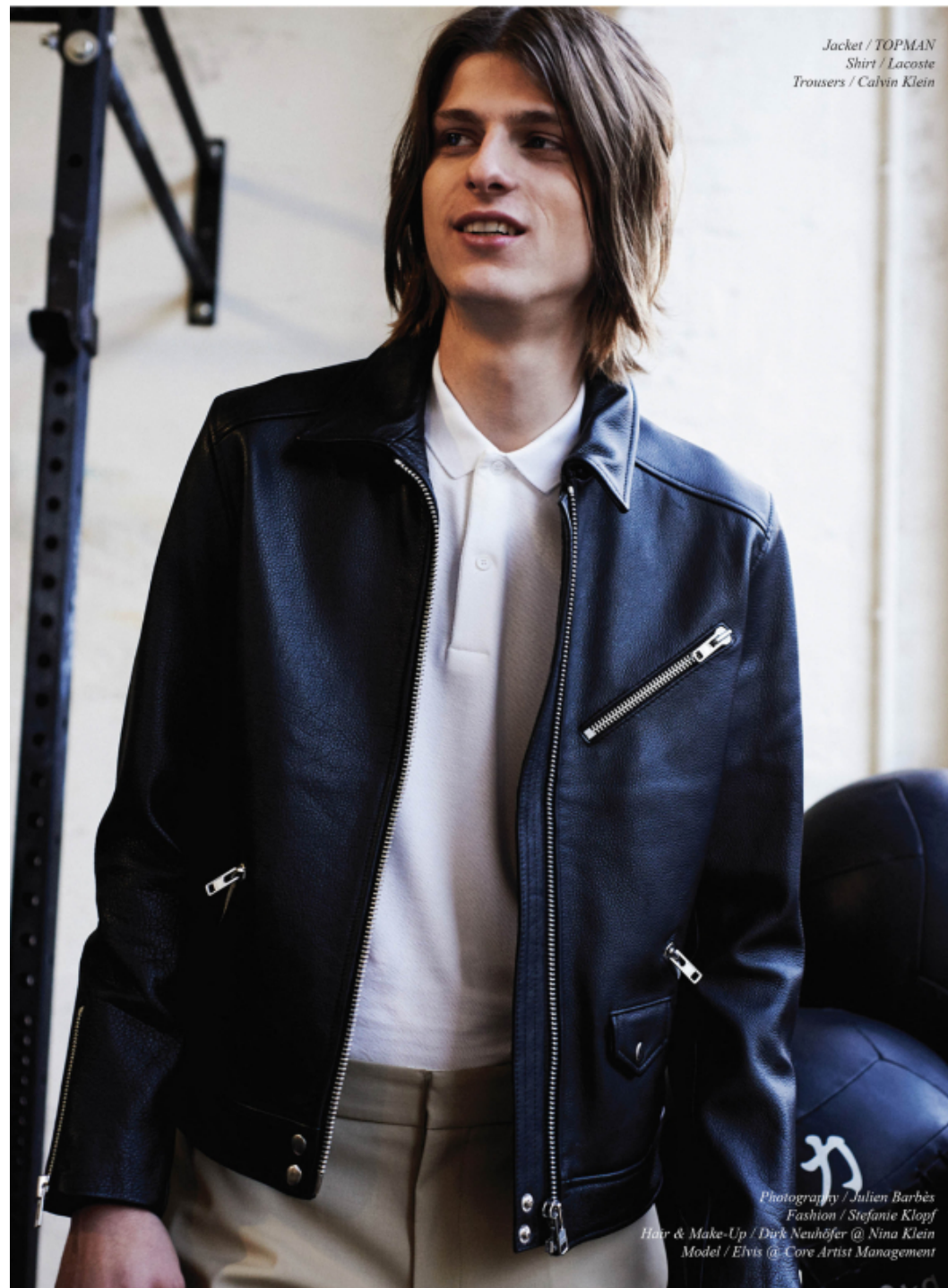
Jacket / TOPMAN Shirt / Lacoste Trousers / Calvin Klein