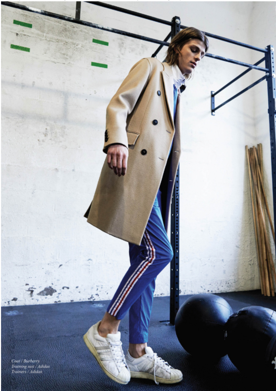
Coat / Burberry Training suit / Adidas Trainers / Adidas