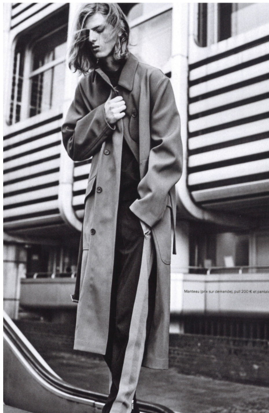
Manteau (prix sur demande), pull 200 € et pantalon 240 € Lacoste.