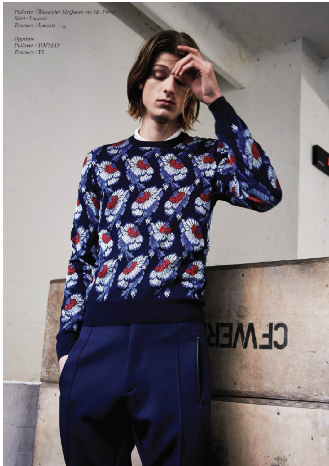
Opposite Pullover / TOPMAN Trousers / Y3