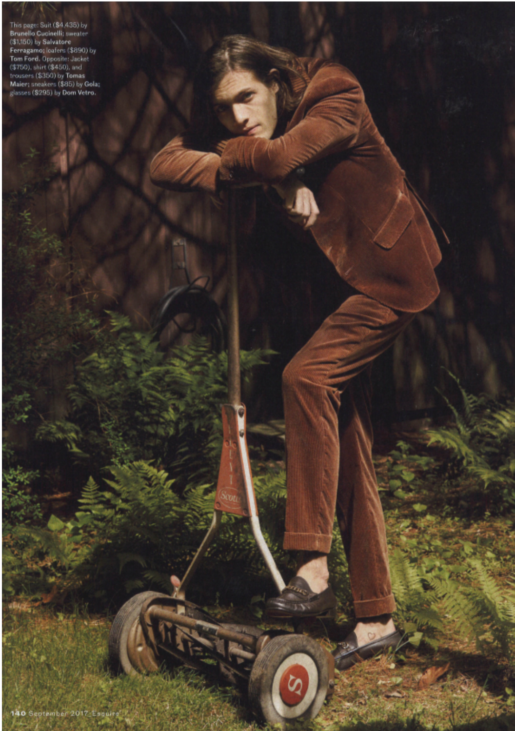
This page: Suit ($4,435) by Brunello Cucinelli; sweater ($1,150) by Salvatore Ferragamo; loafers ($890) by Tom Ford. Opposite: Jacket ($750), shirt ($450), and trousers ($350) by Tomas Maier; sneakers ($85) by Gola; glasses ($295) by Dom Vetrol.