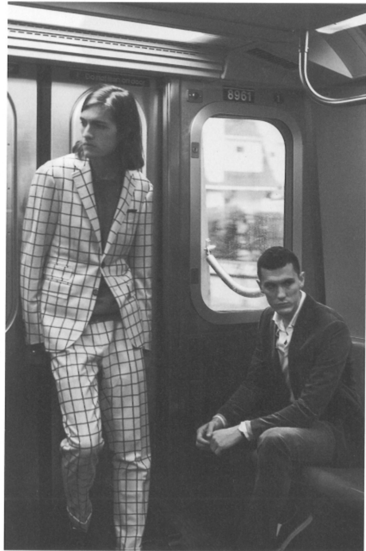
THIS PAGE, FROM LEFT: Suit by Canali, sweater by Brooks Brothers, sneakers by Spalwart. Suit and shirt by Ermenegildo Zegna, sweater by Gucci, sneakers by Maison Margiela, watch by Patek Philippe. OPPOSITE: Suit by Versace. Turtleneck by Wallace & Barnes.